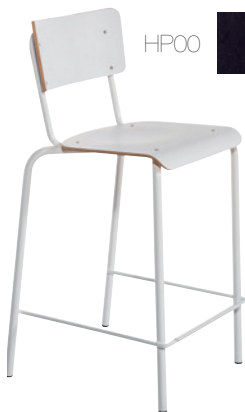
BarCollege ht80 ep01 HP00